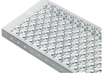
Stepplus N Formstep G6